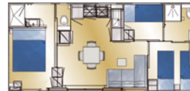
MAISON DES SABLES 6P/3-BEDROOM PREMIUM - 40 M 2