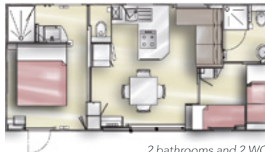
MAISON DES SABLES 5P/2-BEDROOM PREMIUM - 35 M 2

Lounge with sofa that converts into double bed (140 cm)