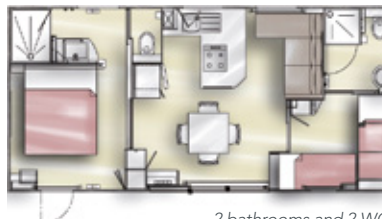
MAISON DES SABLES 5P/2-BEDROOM PREMIUM - 35 M 2

Lounge with sofa that converts into double bed (140 cm)